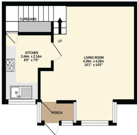
GROUND FLOOR 23.0 sq.m. (247 sq.ft.) approx.